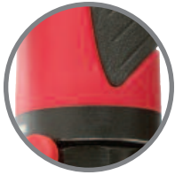
Light weight aluminum reinforced nylon housing