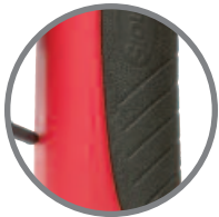
Ergonomic, composite handle with textured soft grip