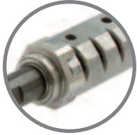
1 HP motor