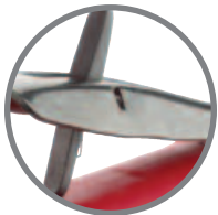
Contoured throttle lever with lock