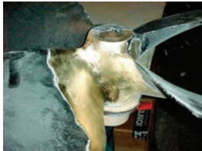
Removes heavy barnacle buildup and 2-part epoxy base coat.