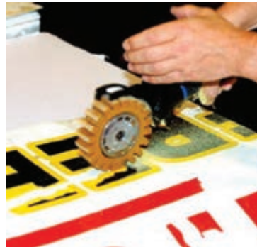
Removes decals, pinstripes moulding tape, adhesives, etc.