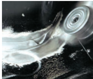
Removes undercoating, slag, and oxidation.