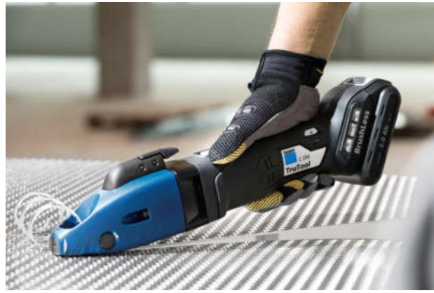
Slitting Shear TruTool C 250 with chip clipper Li-Ion battery 18 V

Unmatched in the industry, the brushless motors have a longer service life. The brushless motor combined with the power-head technology allow the 18 V Li-ion cordless tools to achieve up to 60% longer running performance. Thanks to the movable rotor and the stationary stator, the machine operates contact-free with low wear and tear.