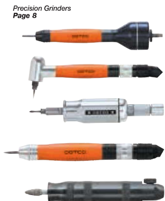
Precision Grinders Page 8