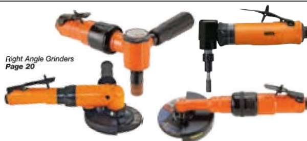
Right Angle Grinders Page 20