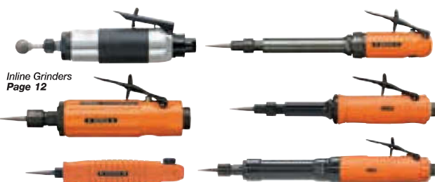
Inline Grinders Page 12

Type 28 wheels are saucer shaped wheels, which are contoured to provide a correct "built-in" grinding angle. Consequently, Type 28 wheels may be used for flat contact on the workpiece.