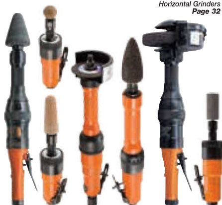
Horizontal Grinders Page 32