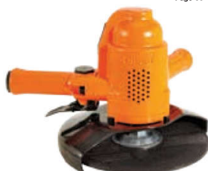
Vertical Grinders Page 35